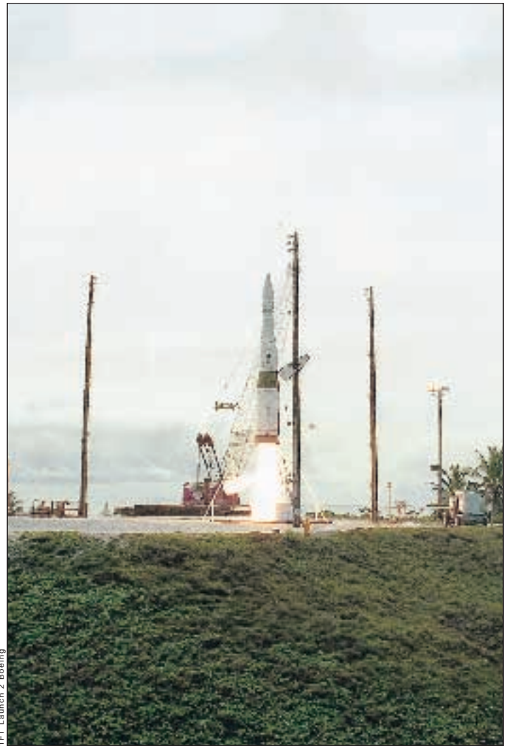
IFT Launch 2 Boeing

NORAD has recognized the realities of the geopolitical changes that have occurred as a result of the collapse of the Soviet Union. The level of resources and readiness throughout NORAD have been scaled back to appropriately reflect a suitable balance between the risk posed by the threat, and the level of effort we apply to address it. Having said this, it remains NORAD's responsibility to provide an adequate capability against aerospace threats, and warning against ballistic missiles, even if the likelihood of an attack is minimal. We all hope that diplomacy and arms control arrangements will be effective in promoting overall stability. Ultimately, however, protection of its sovereign territory remains the primary defensive mission of any nation. It would surely be unacceptable to any citizen of Canada or the US if a nuclear, biological or chemical warhead were detonated anywhere on our territory, particularly if something could have been done to prevent it. This is the context of NMD for the US. While the probability of a ballistic missile attack is highly unlikely, the consequences of such an event could be catastrophic. The US has therefore undertak-