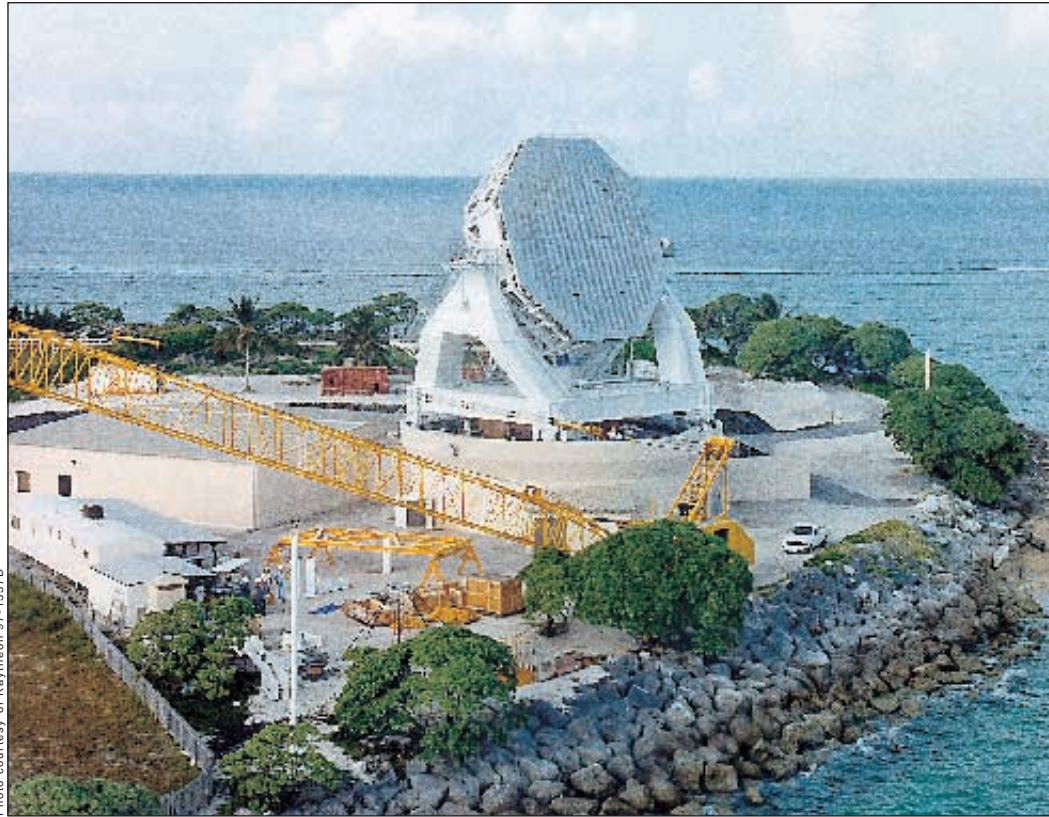
X-brand radar prototype under construction in the Marshall Islands.

the Deployment Readiness Review (DRR) to be held this summer. The DRR will assess the status of the technological feasibility and the operational effectiveness of the system, along with the readiness to