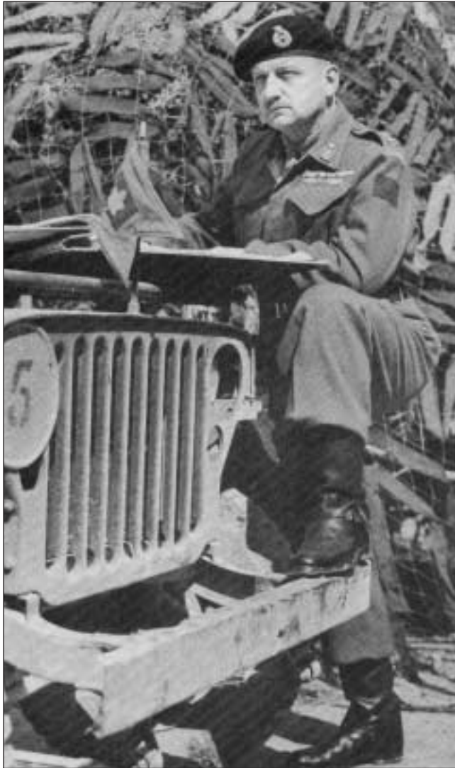
Lieutenant-General E.L.M Burns was Chief of Staff of UNTSO and then subsequently the Commander of UNEF.

Canadians arrived, and within a short time, the entire Canadian contingent of more than 500 personnel, including 200 signallers, four North Star aircraft and over 40,000 pounds of food had arrived. 14