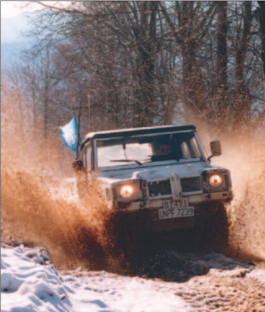
Huge plumes of mud and water fly from the wheels of a CF Ilitis Jeep. The vehicle is particularly adapted for the rugged conditions in the former Republic of Yugoslavia.