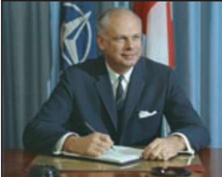
HELLYER'S GHOSTS: UNIFICATION OF THE CANADIAN FORCES IS 40 YEARS OLD