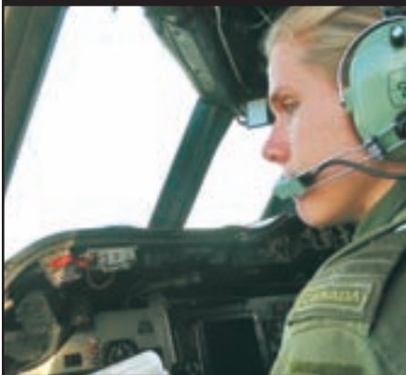
DIVERSITY BEST PRACTICES IN MILITARY ORGANIZATIONS IN CANADA, AUSTRALIA, THE UNITED KINGDOM, AND THE UNITED STATES